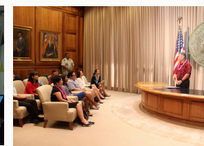
Stay up to date on ADR events and initiatives