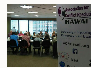
Talk story events support each member's ADR efforts

Build your projects and businesses with the help of other ACRH members. Elicit support for initiatives you are invested in from a recognized organization. Engage with your community on ACRH outreach projects.