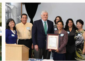
Celebrating Conflict Resolution Day with CADR