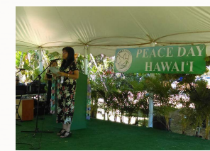
ACRH presents the Peace Poetry Contest award

Celebrate Conflict Resolution Day in partnership with the State government and the Richardson School of Law. Support new peace-builders with mentorship and events, like the annual Peer Mediation Conference.