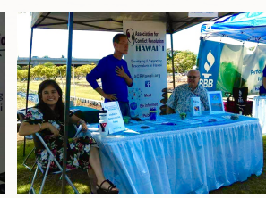
Mock mediations and a resource table at Peace Day